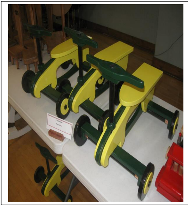
Jack Wright built these colorful rocket scooters.