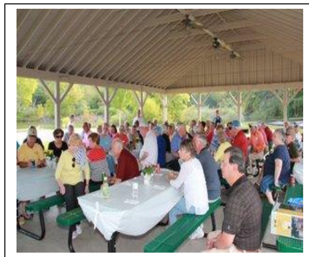
Nothing like food and door prizes to focus everyone's attention.