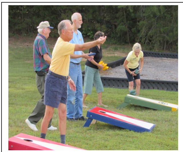
Corn hole was THE popular activity, that is, until it was time to eat!