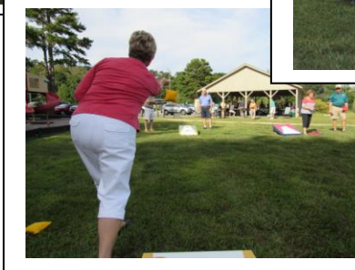
Excellent form displayed by all!