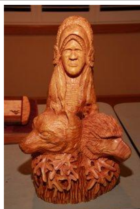
Thom Lewis carved this excellent sculpture out of basswood over a period of four months.