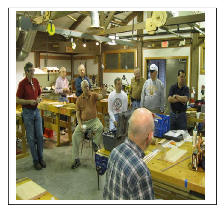
Members listen intently to pre-workshop safety discussion.

woodworkers that share the same interest while learning together."