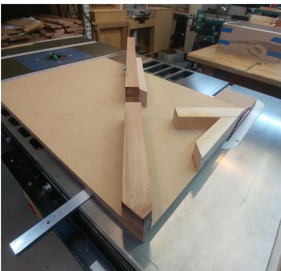
Table Saw Miter Sled