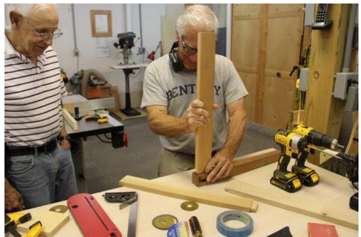
Table Saw Tennon