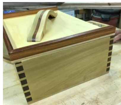
Leigh Jig Box