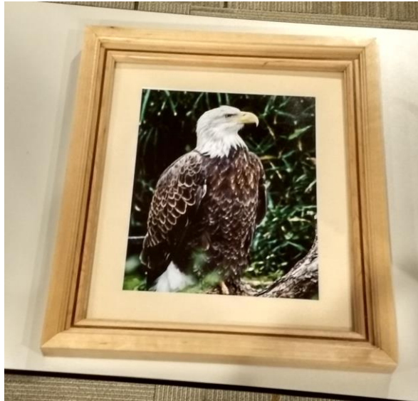
Wes McNeal Maple and Walnut Frame of son's eagle photo