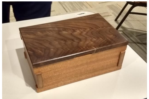
Bill McKeel Walnut Burl and Honduras Mahogany Box finished with sanding sealer and lacquer