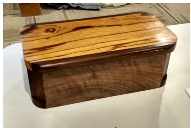
Bill Buelow Marble and Walnut Box