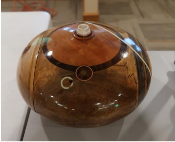
Best in Show