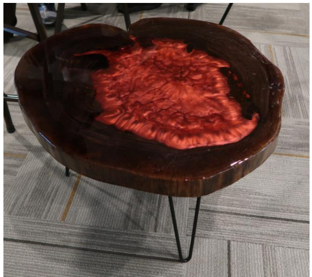
Best Use of Epoxy