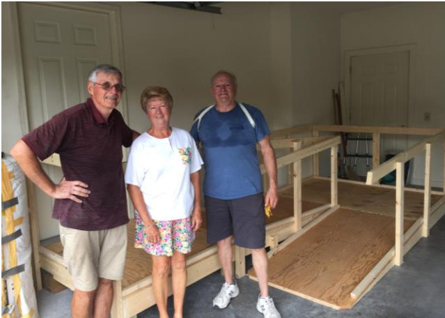
Wheel Chair Ramp Project