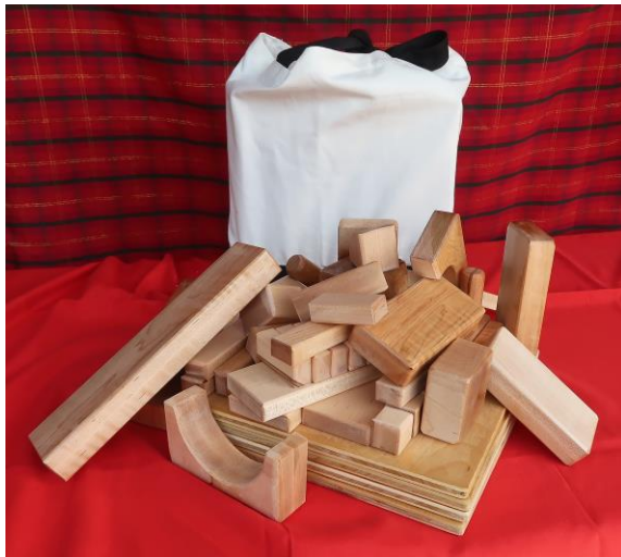
50 Piece Wood Block Set