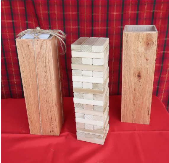
Jenga Games and Box