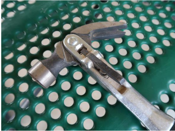
An unusual hammer