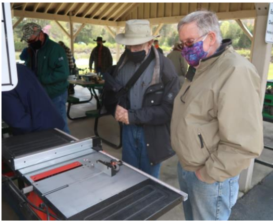
Decisions, decisions, decisions