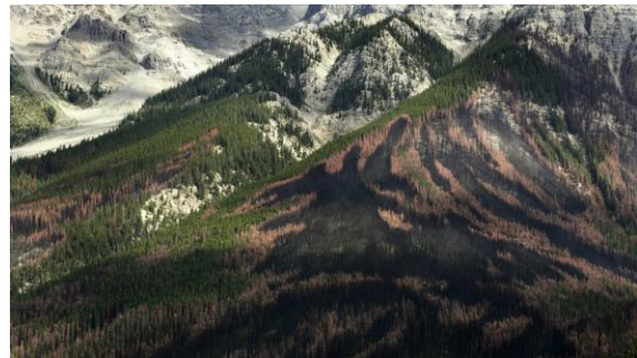
Clearing beetles by fire in BC Pine forests

We are all aware of the soaring prices of construction lumber in the US with future contracts 4 times the price in April 2020. Much is due to the pandemic with logging and mill/kiln shutdowns in anticipation of slower consumer demand and difficulty in ramping production back up.