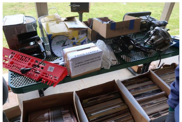
Some of the items for sale or free