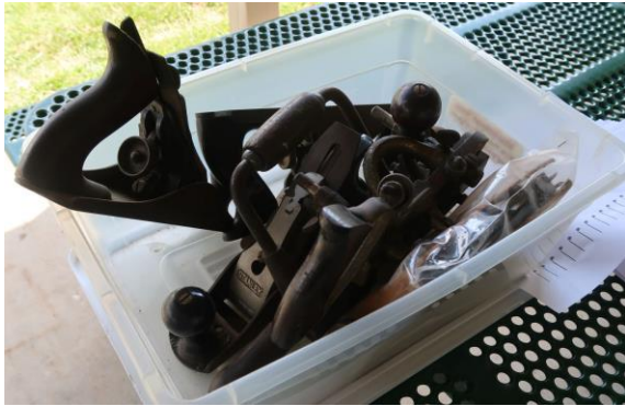
A box of what for sale?