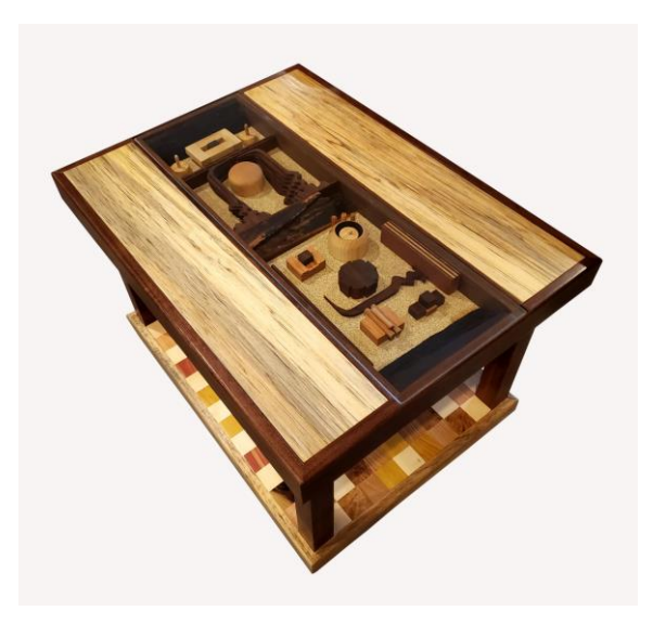
Scrap Wood River End Table – Ned Miller