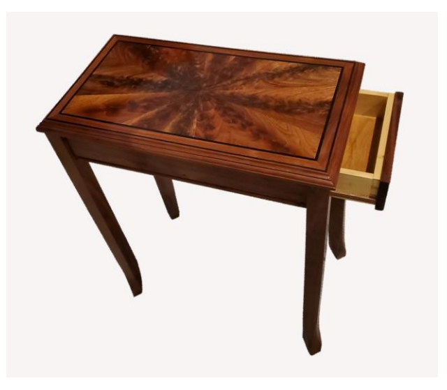
Small Side Table – Bruce Barbre