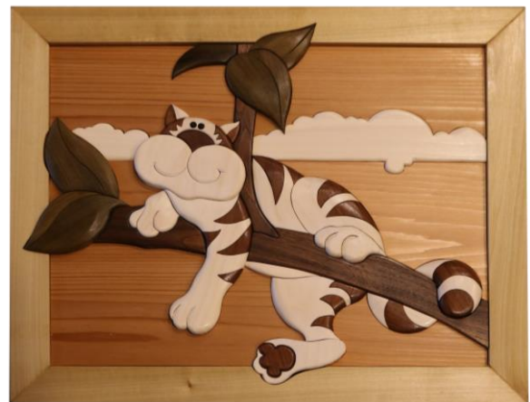
Intarsia cat of poplar, aspen and walnut on cedar background by Randy Brabant