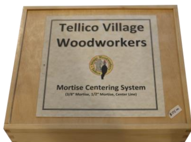
Poplar mortising center tool box by Dick Hoffman