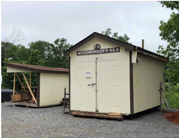
The Kiln in its new location

The kiln has been shifted to its final resting place on the pad. The kiln was leveled by Ron Cirincione, Larry Gardner and Bob Brown but may require further adjustments over time as the pad settles. The power pole has been installed and connection to power is in progress and the kiln should be functional by next week. The sawyer is being contacted to schedule our next cutting as soon as possible.