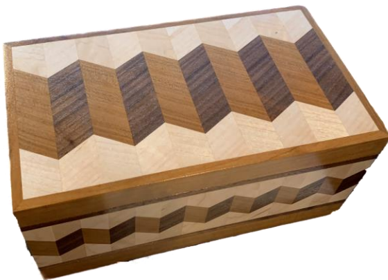
Zigzag Box by Don Larkins Walnut, Cherry, Tiger Maple