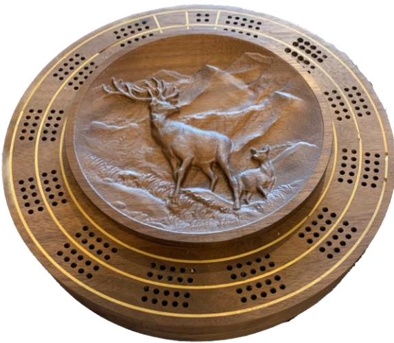
Walnut Cribbage Board by David Brunson using CNC Router