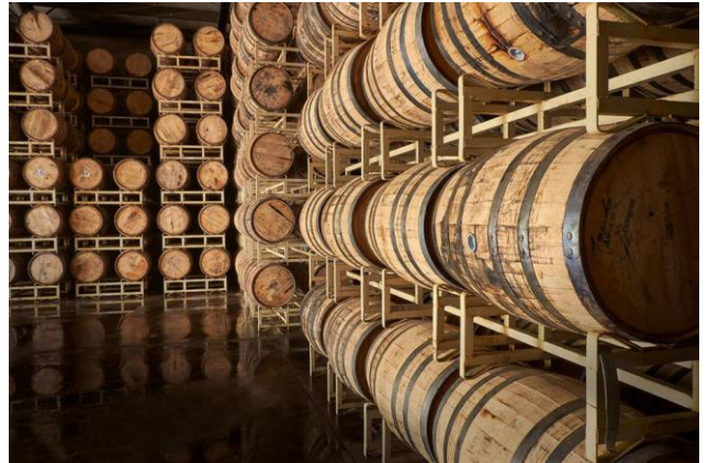
Aging barrels with the good stuff

The production of bourbon barrels consumes over 10% of the white oak annually harvested in the United States. Due to this need, the industry is taking a leading role in assuring a sustainable future for white oak forests in the country.