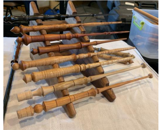
Examples of Magic Wands